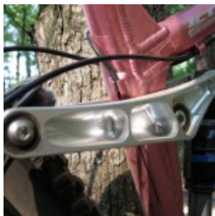
Ellsworth Evolve Rockers