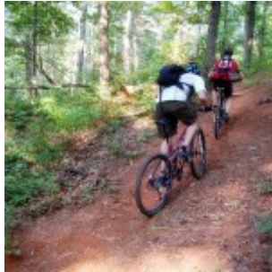
Ellsworth Evolve Climbing