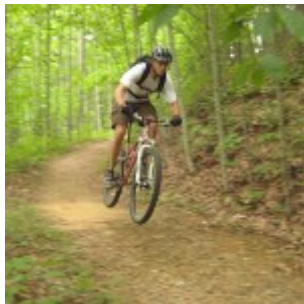
Ellsworth Evolve Double Track