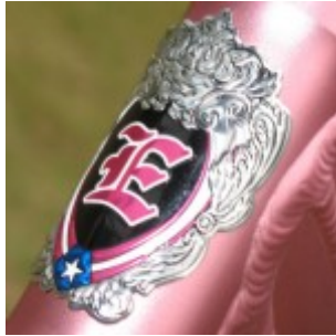
Ellsworth Evolve Headbadge