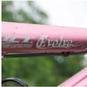
Ellsworth Evolve ICT Logo