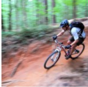
Ellsworth Evolve Gully Run